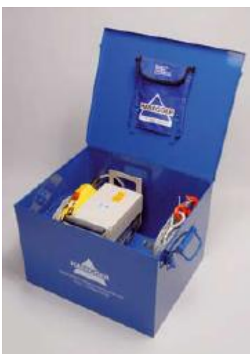
Storage box 520 x 440 x 360 mm Article no. 06231